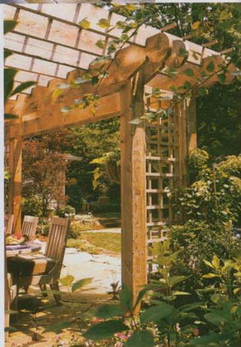
above: Lattice lends architectural interest to the pavilion's four supporting posts. Over time, foliage will fill in the structure's open spaces, creating a green ceiling to shade the dining table below. top: Flowers, shrubs, and other plantings make the urban setting feel secluded. Flagstone paths connect the pool and patio to the dining pavilion.